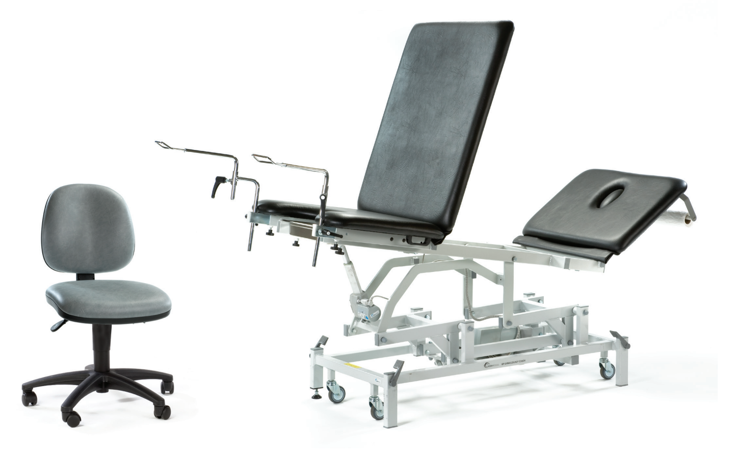
See choice of matching operators chairs on page 50