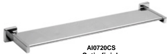
AI0720CS Satin finish