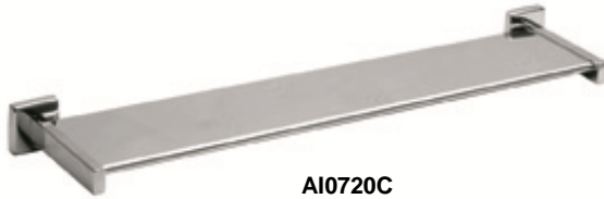
AI0720C Bright finish