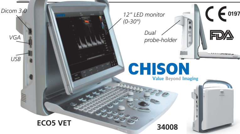
Dicom 3.0 VGA USB