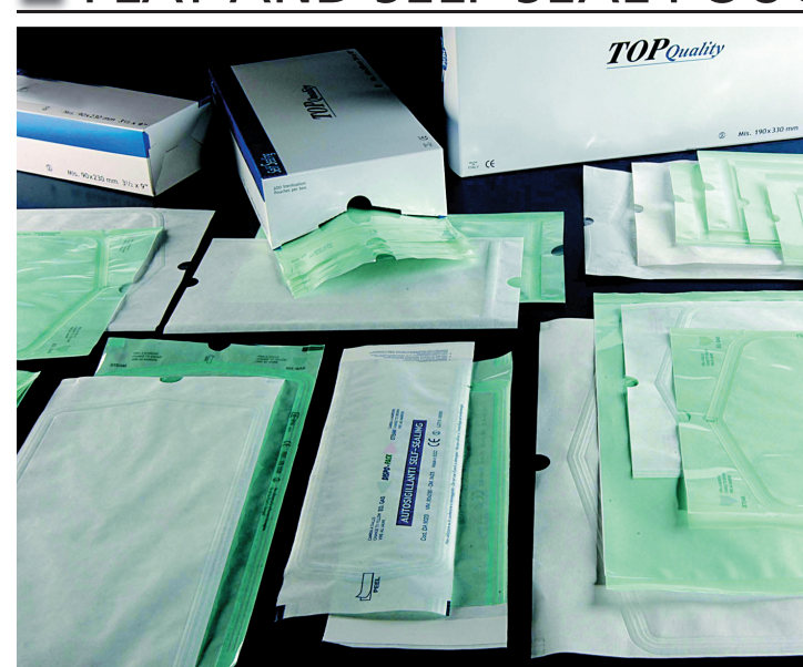
SELF-SEAL POUCHES for sterilization by autoclave, steam or ethylene oxide gas

Self-seal pouches consist of light green, polyester-polypropylene transparent film coupled to medical grade paper which permit steam and gas penetration during sterilization.