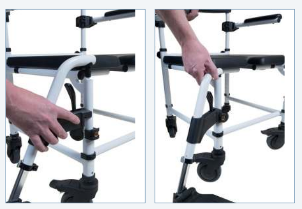
The legrests can be mounted without tools and can be folded away to the side to facilitate entry and exit.